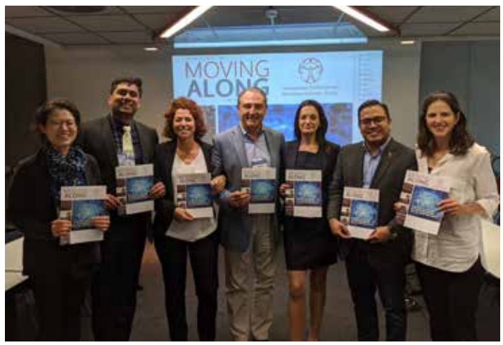
Members of the Moving Along Editorial Board in Nice, France

As we move to a new year and decade, I am pleased to announce that this is the first electronic-only issue, as we now will cease printing and mailing copies of Moving Along . This will allow for faster more efficient and environmentally friendly distribution to MDS members. This final