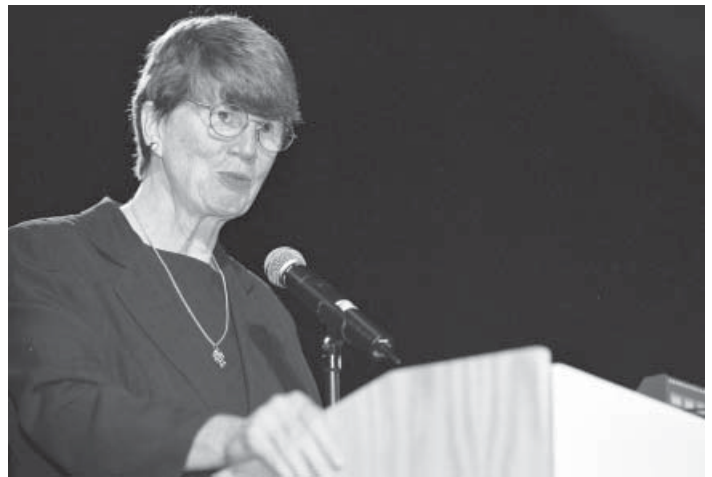
Janet Reno, speaking to a standing-room only crowd at the Congress Opening Ceremony

Ms. Janet Reno, former US Attorney General, was a featured speaker at the Congress Opening Ceremony on November 10 th 2002. Ms. Reno discussed her personal perspectives as a patient living with Parkinson's disease.