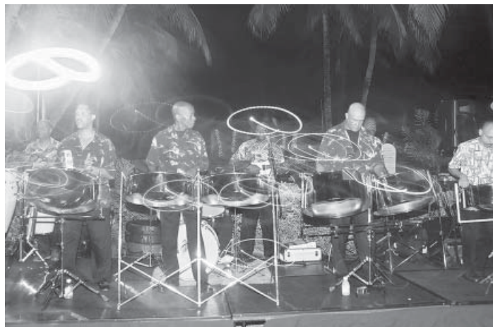
A steel drum band performs for Congress attendees

Additionally, attendees were invited to celebrate on Wednesday, November 13 during the Congress Banquet held at the Miami Seaquarium. Guests were fascinated with the Seaquarium's featured stars, during the dolphin and killer