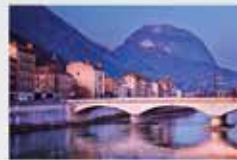
Deep Brain Stimulation for Movement Disorders September 10-11, 2015 Grenoble, France