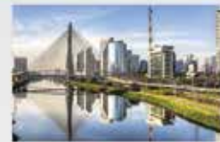
Allied Health Team Training for Parkinson's Disease September 10-12, 2015 São Paulo, Brazil