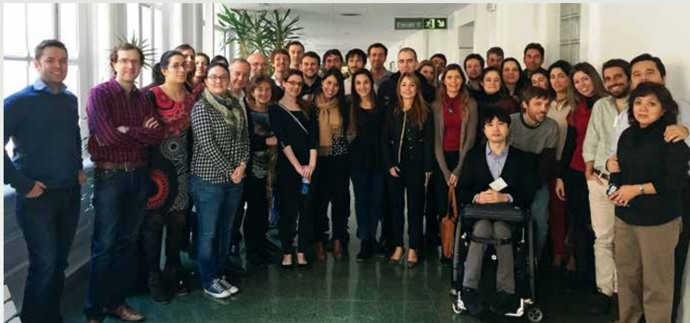
Thirty-eight participants attended the course from fifteen different countries.

more specific aspects of sleep disorders in Parkinson’s disease, such as “REM Sleep Behavior Disorder,” “Insomnia” and “Hypersomnia.” Other topics included: “Restless Legs Syndrome in Parkinson’s disease” and “Vocal Cord Paralysis in Multiple System Atrophy.” Some of the highlights of the course were the multiple videos of patients presenting sleep disorders (restless legs syndrome, periodic leg Movements in sleep, cataplexy attacks, vocal cord paralysis, REM sleep behavior disorder, etc). In addition patients were invited to explain their sleep disorders during the talks. There were patients with Idiopathic Restless Legs Syndrome, Idiopathic REM sleep behavior disorder, Abdominal Restless Legs, Restless Legs Syndrome with Parkinson’s disease and also with the novel “Iglon5 parasomnia.”