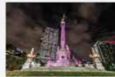
MDS-PAS School for Young Neurologists November 26-28, 2015 Mexico City, Mexico

Dates and Locations are subject to change. For a complete up-to-date list of courses, visit www.movementdisorders.org/MDS/education.htm