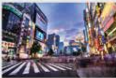
Basic Scientists Summer School August 6-8, 2015 Tokyo, Japan