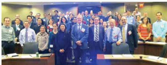
Group photo in lecture hall