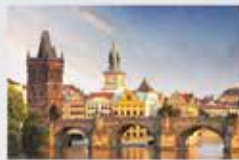
MDS-ES Summer School for Young Neurologists September 4-6, 2015 Prague, Czech Republic