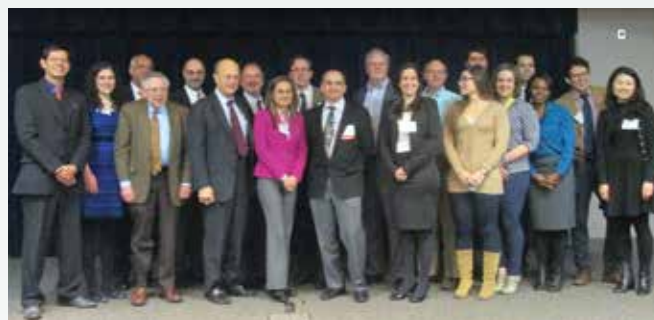
Group photo after video dinner challenge