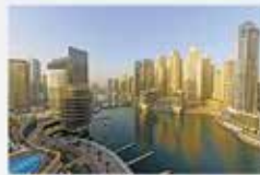
2nd Middle East Camp for Parkinson's, Movement Disorders and Neuromodulation November 19-21, 2015 Dubai, UAE