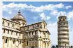
Bridges and Boundaries in Movement Disorders: The Role of Neuroimaging November 12-13, 2015 Pisa, Italy