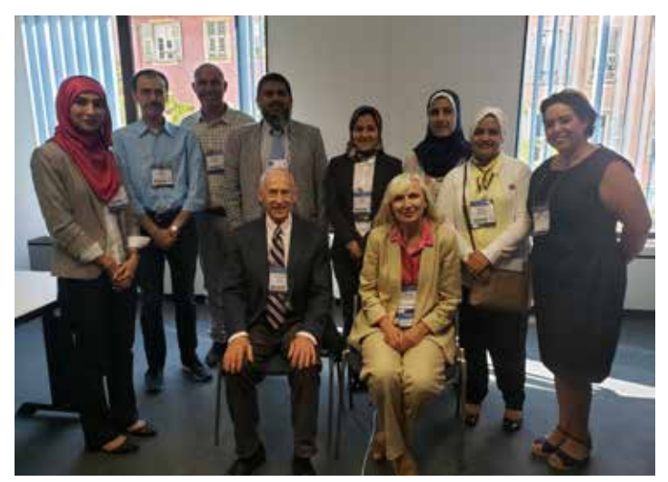
Members of the MDS Middle East Working Group in Nice, France, 2019

The International Parkinson and Movement Disorders Society (MDS) created the Task Force for the Middle East in 2016 to explore the region's challenges, limitations and set the foundation for the growth of PD and movement disorders. Since the MDS Task Force creation, noticeable changes were observed in educational activities, membership growth and raising awareness. To assess the region's needs, the Task Force conducted a survey in 2016. It was the first survey that shed light into the unmet needs in providing care for people with PD in the MENASA countries, the scarce of the movement disorders' specialists, educational opportunities, research, as well as the high cost of treatment, the lack of general health infrastructure, resources and health insurance coverage were described as the main barriers to provide care for people with PD in the MENASA countries. The data suggested that there is a great need to increase the awareness of PD and to provide educational opportunities within this field in the MENASA countries.