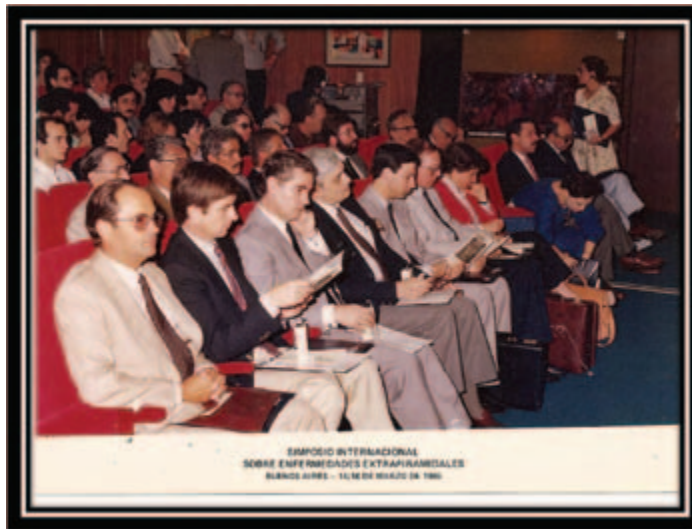
International Symposium of Extrapiramidal Diseases, Buenos Aires, 14-16 march 1985

In recent years the group has grown by virtue of the teaching spirit of its members and the commitment to promote and disseminate every aspect (scientific, social, and legal) of movement disorder diseases. It has also strived to open more effective lines of communication with other colleagues, with patients and their families, and with the community in general. Our group of well known neurologists has grown thanks to the contribution of all of the members, who are dedicated to teaching and promoting the different aspects (scientific, social or legal) of the diseases included in the field of the Movement Disorders. The Movement Disorder Group has an important role in The Argentinian Neurological Society, and has been working hard during last years to be present