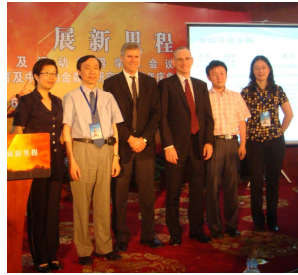
Nanchang, China Course