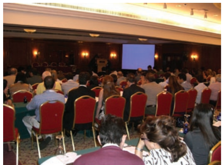
View of the room with a large number of participants.